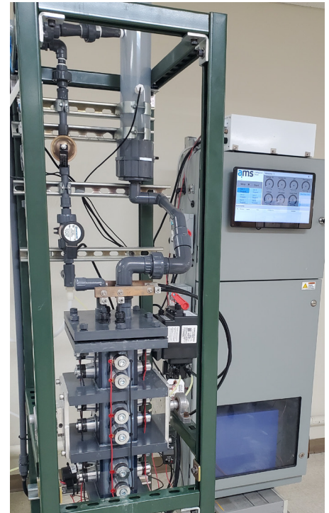
SafeGuard™ H2O On-Site Stannous Generation System