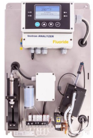
Instran® Fluoride analyzer

The analyzers provide high frequency real-time data with a sensitivity of 10 ppb or 0.01 mg/L and a measurement time of approximately 10 minutes to support sustainable, accurate control of industrial water and wastewater treatment processes. The fully automated online Instran® analyzer can operate reliably regardless of sample matrix conditions, a unique attribute of this innovative technology.