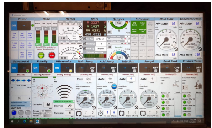
SafeGuard H2O Arsenic Removal System Control Panel

The SafeGuard H2O technology uses a non-toxic, certified reagent precursor material (low carbon steel) and an in-situ electrolytic generator to create a ferrous reagent onsite and on-demand. SafeGuard H2O features automatic dosing and incorporates proprietary continuous, real-time monitoring of contaminant levels at the influent and effluent to ensure optimal treatment and compliance with regulatory and operational targets 24/7/365. As with any water treatment system, high frequency continuous water quality monitoring of contaminants such as arsenic and iron at critical treatment process steps supports process automation, optimization, reliability, and can give remote visibility of system performance for the utility and their customers.