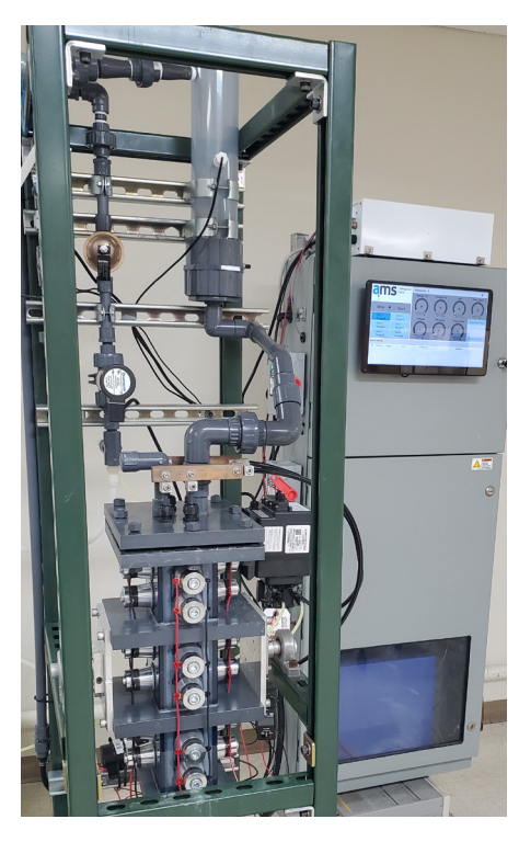
SafeGuard™ H2O On-Site Stannous Generation System