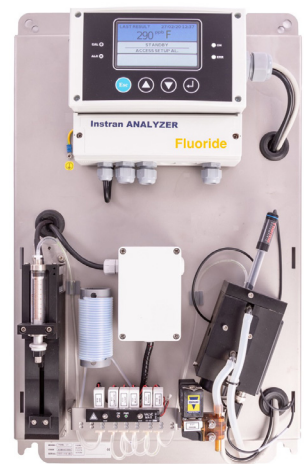
Instran™ Fluoride analyzer

The analyzers provide high frequency real-time data with a sensitivity of 10 ppb or 0.01 mg/L and a measurement time of approximately 10 minutes to support sustainable, accurate control of industrial water and wastewater treatment processes. The fully automated online Instran™ analyzer can operate reliably regardless of sample matrix conditions, a unique attribute of this innovative technology.