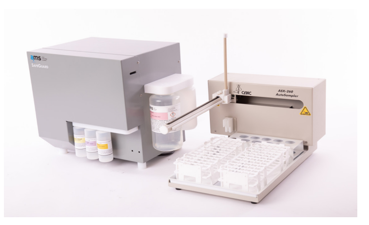
MetalGuard<sup>™</sup> Lead Alert!<sup>™</sup> can be used in conjunction with SafeGuard<sup>™</sup> Lead for rapid low-cost analysis of locations predicted to be at risk for an increase in contamination risk.

The drinking water crisis in Flint brought national attention to the fact that many cities struggle to ensure safe water due to lack of funding and aging infrastructure. However, in Newark, the city's lack of real-